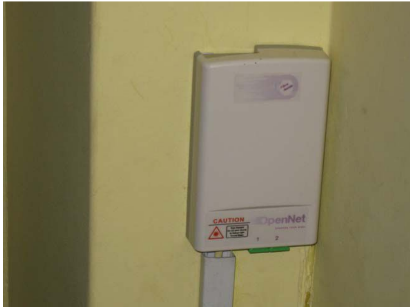
Figure 3: Wall-mounted termination box

To prevent accidental exposure to laser light from the fibres, it is recommended to orientate the connectors of the termination box (at the NTP) downwards toward the floor (Figure 3).